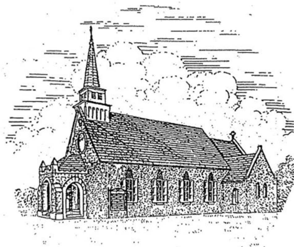
Hope Episcopal Church Mt. Hope, Pennsylvania