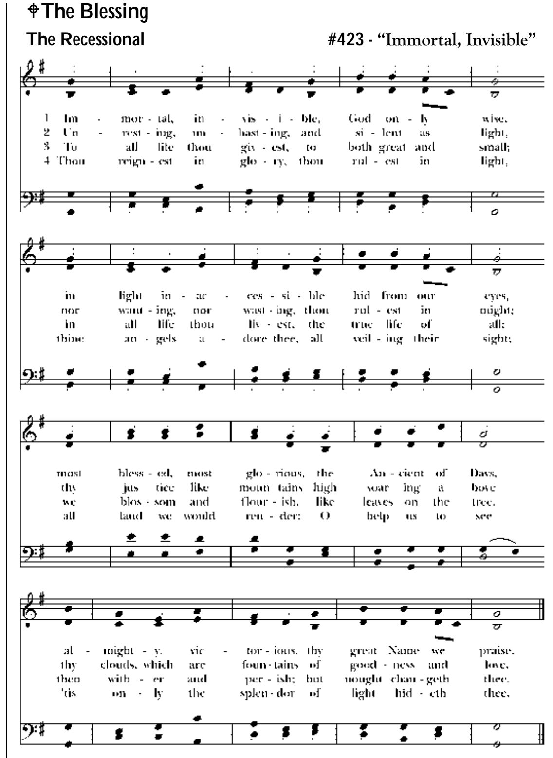
The Blessing & Dismissal

In the blessing and dismissal we are reminded that we carry the peace and love we have received from Christ into the world. We are challenged to live out the Gospel in our lives outside the walls of the church so that others may see and be drawn into new life in Christ.