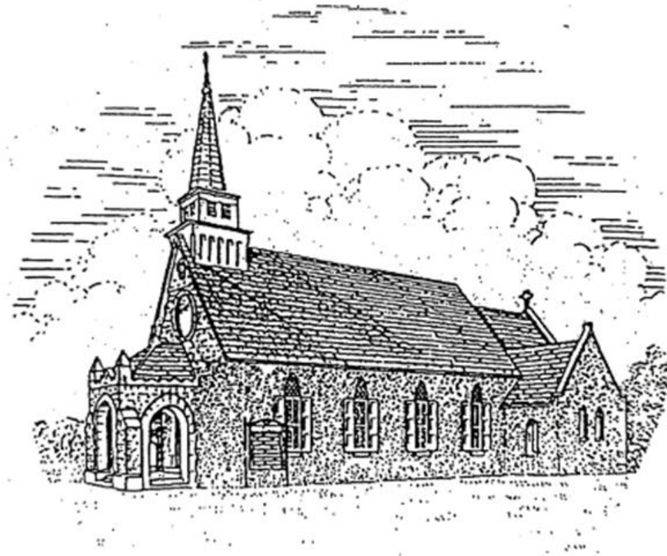
Hope Episcopal Church Mt. Hope, Pennsylvania